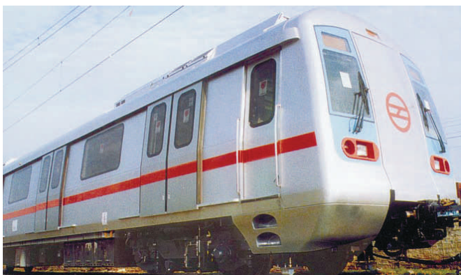
Delhi metro coach – going places

For Delhi alone, about 124 all stainless steel coaches have been procured and an order for 300 more coaches is in the pipeline. Each coach weighs about 10 tonnes. When the system comes up in other cities also,