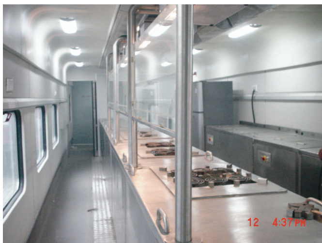
Above Pantry car; Right: Modular toilet

Over a period of about eight years, this decision of the railways to go all out for stainless steel coaches would add about 13,000 TPA of stainless steels for the shells