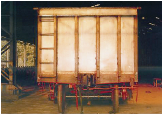
A stainless steel coal wagon

This is an excellent example of doing Life Cycle Costing Analysis and realizing that though the initial cost of stainless steel wagon is higher, much better profits are to be made by specifying stainless steel!