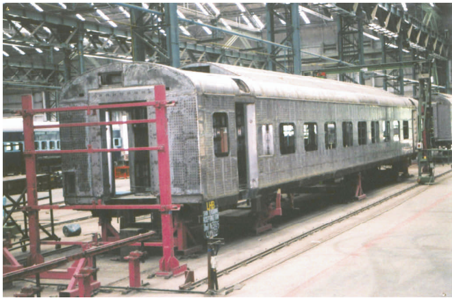
LHB stainless steel coach shell