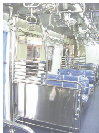
Above: Interiors of Hyderabad suburban coach; Left: Interiors of Mumbai Local Train