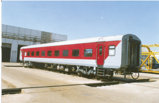
Painted LHB using 3Cr12 variant for side and end-walls alone. The interior furnishing and other fixtures would be mean additional use of stainless steel by the railway coach sector.